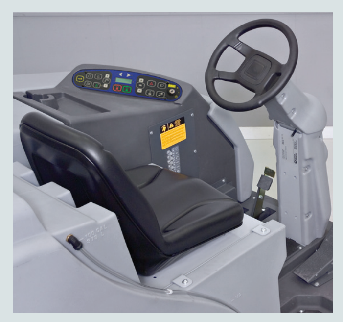
The Clear-View ^{\text{\tiny M}} machine design provides excellent sight lines to the floor from the comfort and safety of the operator's seat.