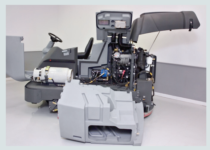
MaxAccess<sup>™</sup> design provides 360 degree access to machine components.