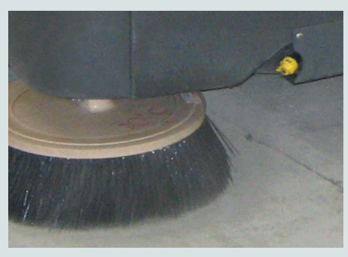
DustGuard™ suppresses airborne fugitive dust allowing continuous use, and increasing productivity by up to 71%.