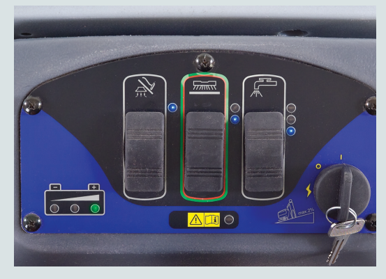
The ST 26 inch disc model – provides simple operation and robust scrubbing controls.