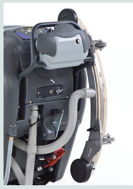
A built-in squeegee hanger makes transport easier and reduces trip and fall accidents.