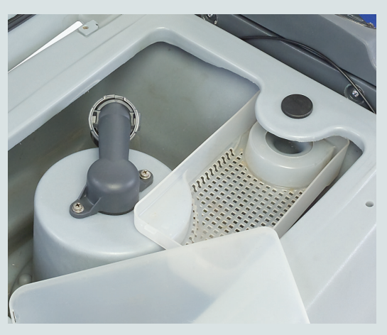
An integrated debris catch cage traps and collects drain clogging debris.