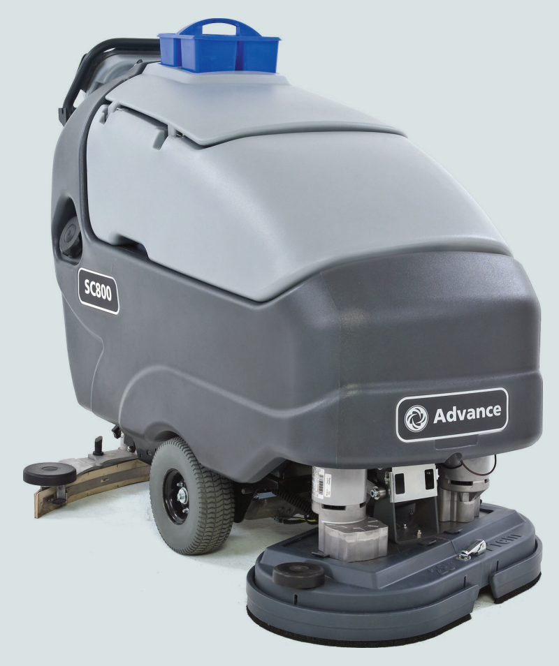
One-Touch<sup>™</sup>, integrated scrub pressure and solution flow rate settings:

Advance's rugged, low-maintenance SC750<sup>™</sup> and SC800<sup>™</sup> scrubbers deliver incredible value on a walk-behind platform. High productivity per tankful allows for 84 minutes of continuous scrubbing, which reduces dump/refill cycles and helps provide fast ROI. The optional EcoFlex<sup>™</sup> System offers the flexibility to clean across the entire cleaning spectrum from green to clean. At the touch of a button one can switch from chemical free cleaning to using an ultra low dilution ratio, and of course detergent can be used at full strength for the toughest of soils. The burst of power feature lets you easily apply more pressure, more solution and more detergent at the touch of a single button. With the flexibility to easily apply the right scrubbing performance for the job, you'll use less detergent, minimize water use and save on cleaning costs.