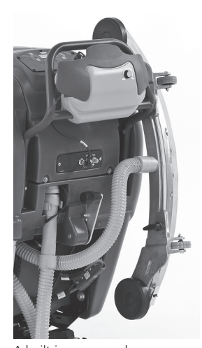
A built-in squeegee hanger makes transport easier and reduces trip and fall accidents.